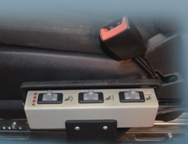
SEAT MOUNTED SWITCHES